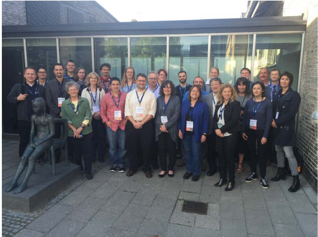
Casting a HypoxiNet.